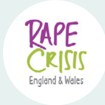
Rape Crisis 0808 802 9999